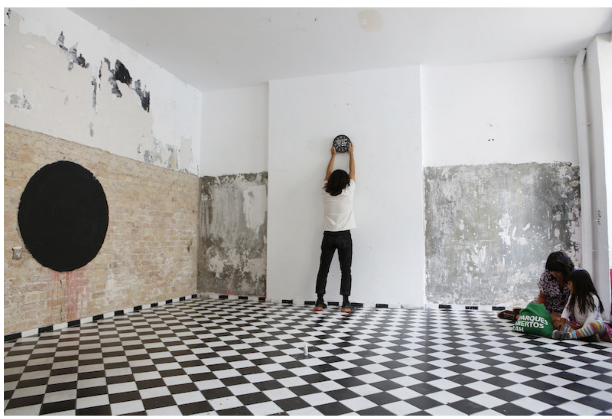
Project Space Festival, 11.08.2018, grüntaler, LEISE, NINE