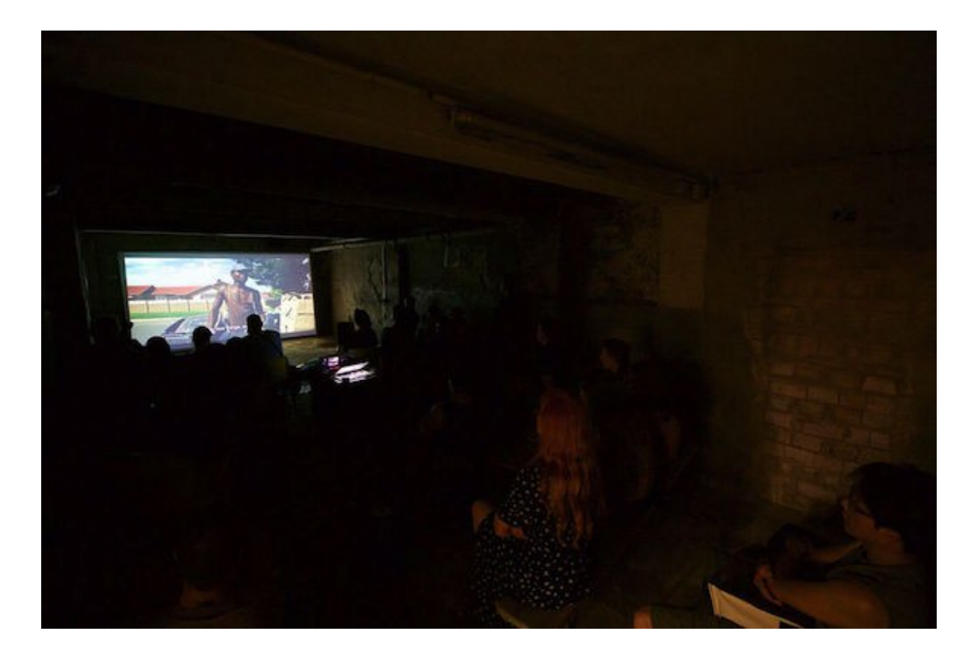
Share (http://www.addthis.com/bookmark.php?v=250&username=xa-4c94e6ba1549a372) (#) (#) (#)